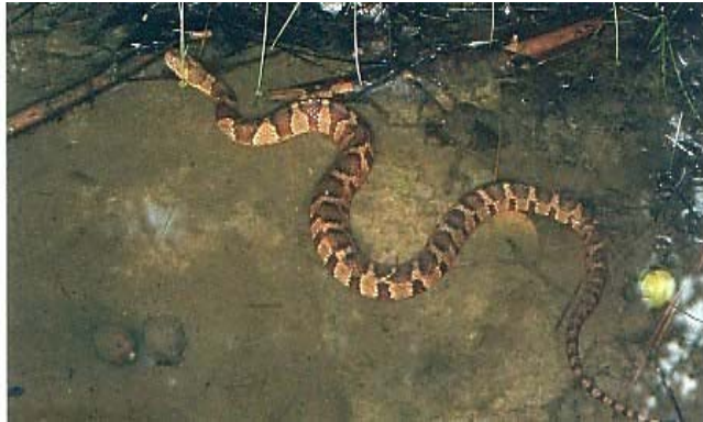
Northern Water Snake