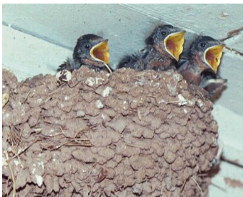
Barn Swallow Young in Nest