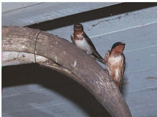
Barn Swallow Adults